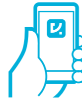
SERVICE PROVIDERS AND ELECTRIC MOBILITY